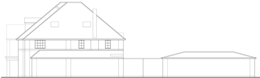
SIDE ELEVATION north