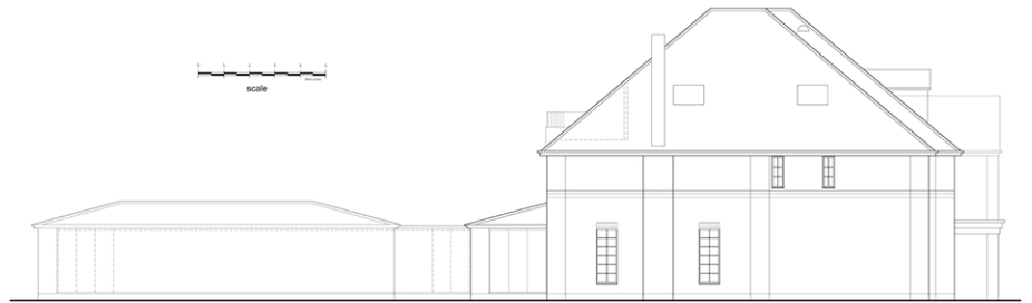
SIDE ELEVATION south