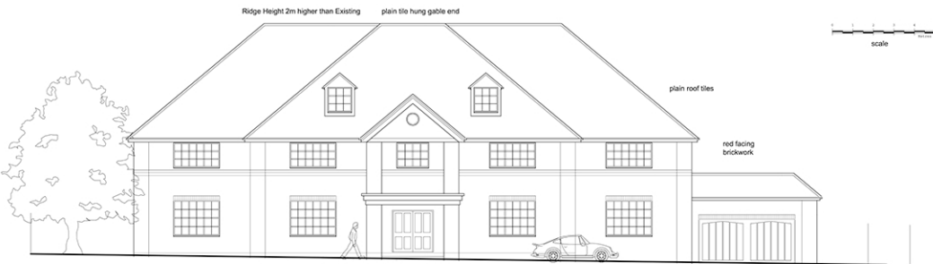
FRONT ELEVATION east