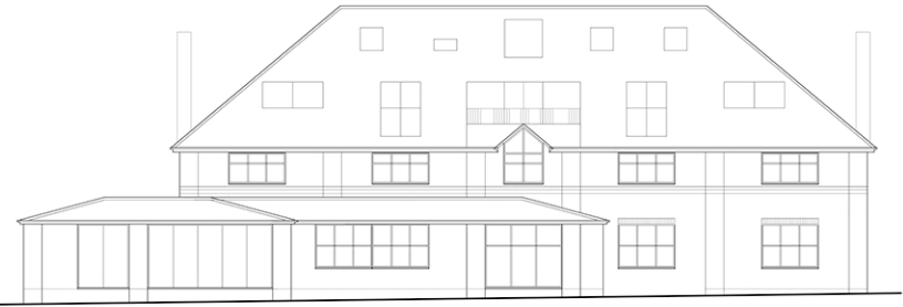
REAR ELEVATION west